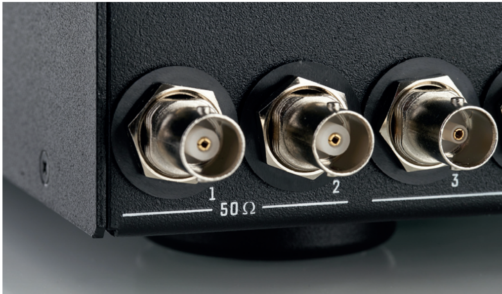
The two 50Ω BNC outputs in detail. The difference between 50Ω BNC sockets (outputs 1 and 2) and 75Ω BNC connectors (output 3) can be identified easily in regards of their different white isolation material thickness

to an audible gain in sound quality. I am set on a hard head-to-head race between the two clocks, in which I will work out the finest differences between the two clock generators by switching back and forth several times between them.