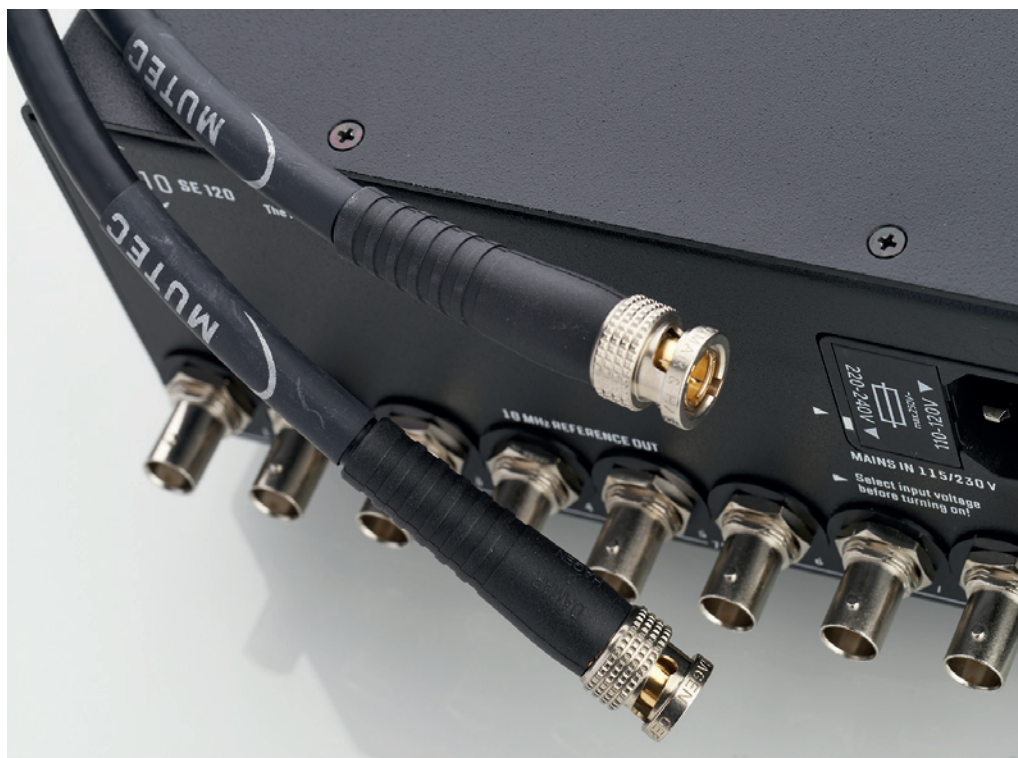
The 75Ω clock cables from MUTEc