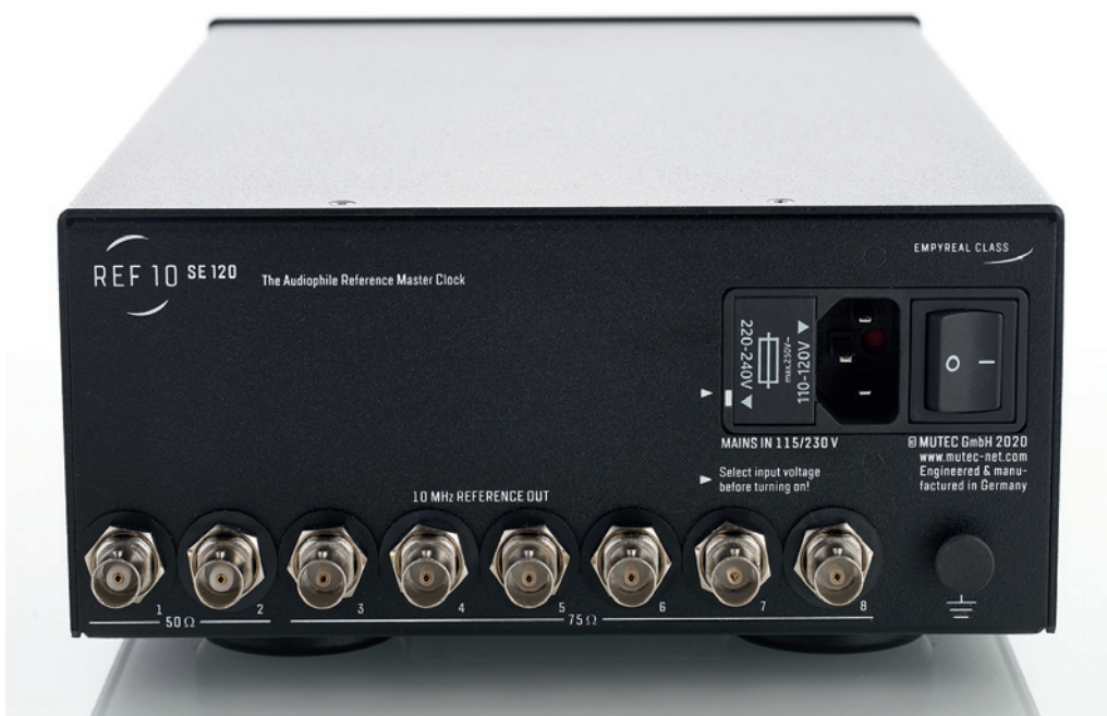
The clock outputs of the REF 10 SE120: 2 x BNC 50Ω and 6 x BNC 75Ω

But what is this phase noise all about and why is this value so important for a clock in the audiophile world? Intuitively, we know that low noise in a system is better than high noise. Walter Schottky explained the physical phenomenon as a measurable irregular current fluctuation. If we amplify this fluctuation and make it audible via a loudspeaker, we hear the typical noise that we commonly understand as noise and which also gave the phenomenon its name. But this rather analog understanding of noise has only a partial connection with the term