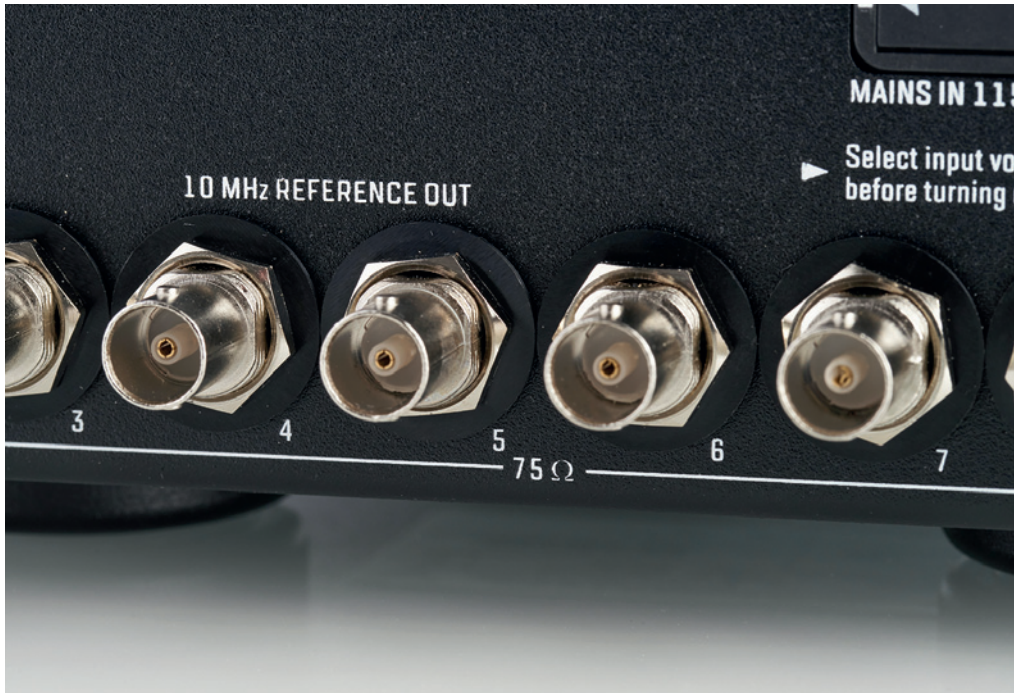
The 75Ω outputs in detail

used in modern electronics. Here, noise is generally characterized much more as any unwanted signal that interferes with the main signal. It can interfere with any parameter such as voltage, current, phase or frequency. In the case of an oscillator, we are primarily interested in the frequency stability of its signal. Here we distinguish between the long-term stability and the short-term stability. The long-term stability refers to the amount by which the absolute clock frequency drifts over a longer period of time. Causes can be for example aging processes or temperature fluctuations of components. Even if this is important for telecommunications or studio applications, for example, it has, according to MUTEC, no influence on the quality of the reproduction of digital audio material.