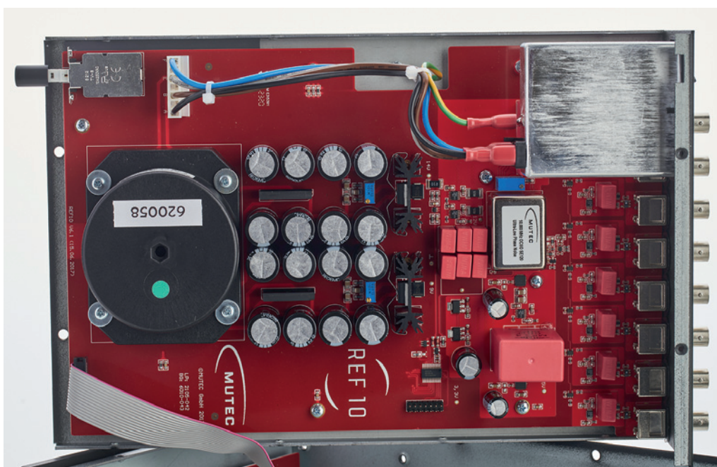
The inner life of the REF10 SE120 from left to right: large dual toroidal transformer, lush filter capacitances, sophisticated voltage stabilization, oscillator circuitry and extensive power input filtering

Accordingly, I carefully prepare my listening test. As always, my tried and tested music server with XEON processor and Windows Server 2019 in Core Mode, tuned with Audiophile Optimizer, is used as the audio source. JPLAY Femto, MinimServer, JRiver26 and Roon Core are installed on the server as music management software. My two cascaded MUTEK MC3+USB are interconnected on the USB path to my PS Audio DirectStream DAC and are to draw their clock from either the REF10 or the REF10 SE120.